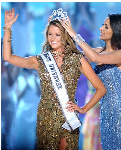
↑ Jennifer Hawkins being crowned Miss Universe in the famous Bora evening gown in 2004