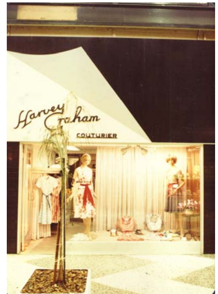
↑ Harvey Graham Couture, where Tengdahl Australia is today located in Brisbane Arcade

BRISBANE ARCADE QUEEN ST MALL CELEBRATING 90 YEARS