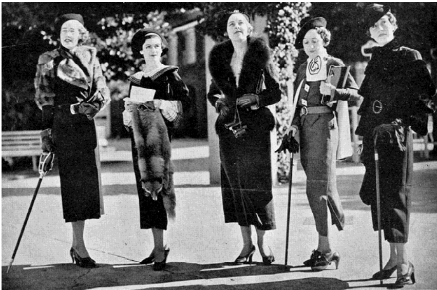
Another Paul's Shop Triumph.—Paul's lead the fashions on Stradbroke Day at Ascot. Mannequins' display on the lawns at Ascot of fashions from Paul's distinguished collection at Brisbane Arcade, Adelaide Street.

↑ Pauls – another famous Brisbane Arcade retailer. Brisbane Arcade has been a dominant force in race wear and Fashions on the Field contests around Australia...just like this image shows at Eagle Farm Stradbroke Handicap Race Day, June 1935