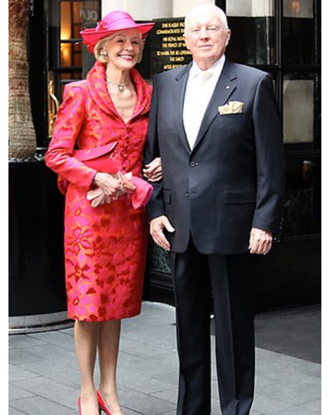
↑ Her Excellency, Quentin Bryce, Governor General of Australia with husband, Michael Bryce attending the royal wedding of the Duke and Duchess of Cambridge in 2011